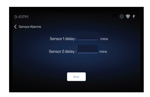
Configuring a Sensor