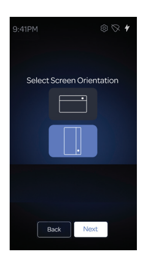
2. Select Device Orientation