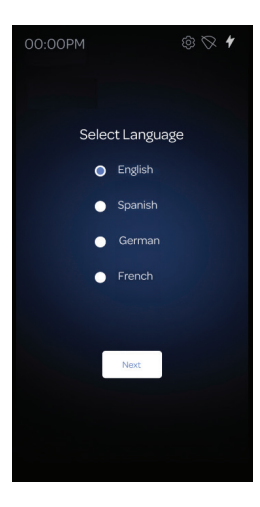
1. Select Your Language

First , select the language that you want your 7600 Data Logger to display in. Second , select the orientation (either landscape or portrait) that you are going to mount your 7600 Device.