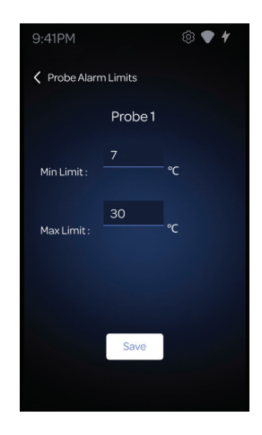
Configuring a Probe

On the device, go to Settings \Rightarrow Device Configurations \Rightarrow Probe Configuration or on traceablelive.com , go to Device \Rightarrow Settings tab .