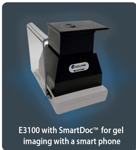
E3100 with SmartDoc™ for gel imaging with a smart phone