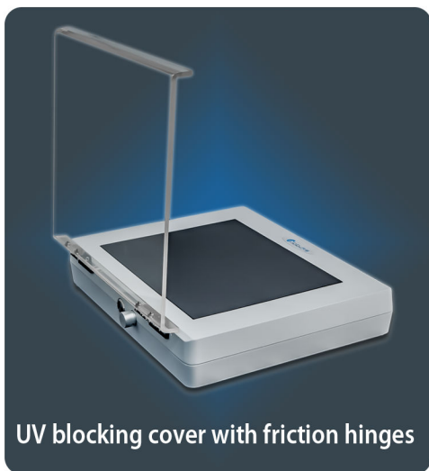
UV blocking cover with friction hinges

The acrylic UV blocking covers allow safe viewing of samples, and friction hinges on the front edge allow the cover to be fully closed or positioned at an angle for gel access and band excision.