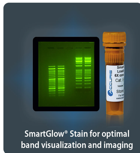
SmartGlow® Stain for optimal band visualization and imaging