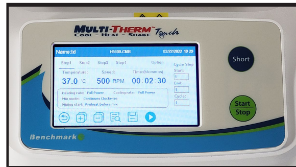
Complete touch screen control

Easy to use and reliable in operation, the MultiTherm Touch is covered by a 2 year warranty. Blocks and heated lid are sold separately.