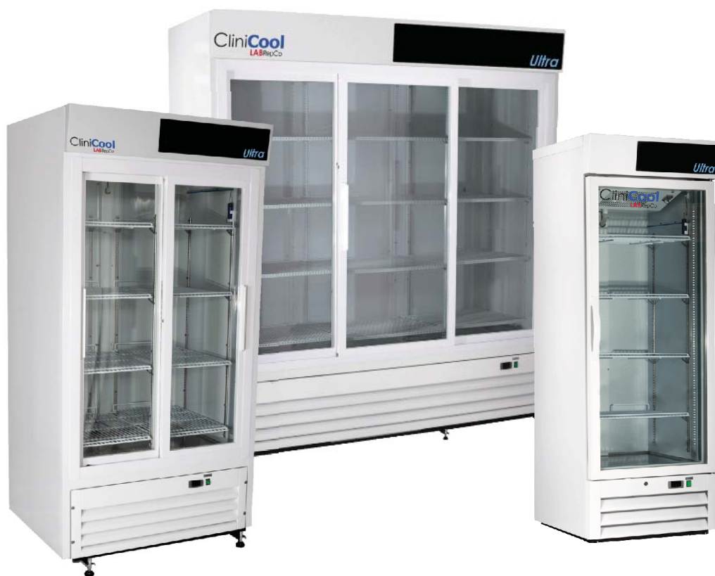
Digital Temp Display/ Microprocessor Temp Controller