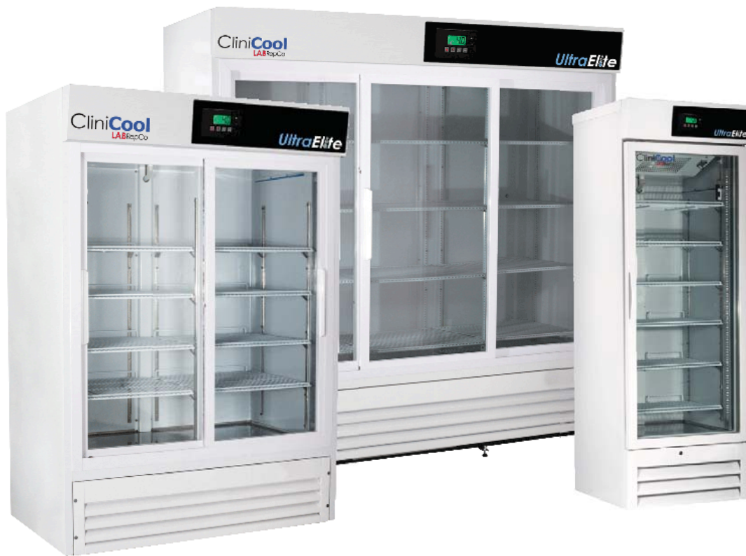
Standard Digital Temp Display & Alarm Module